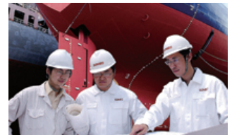
Trade and Services