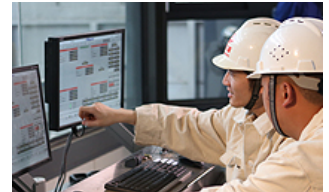
R&D and Manufacture